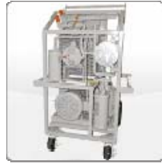
LARGE TONNAGE HP RECOVERY

View full product line at www.reftec.com