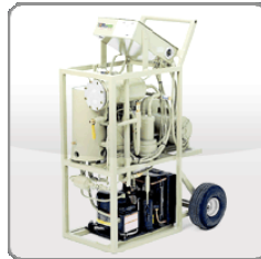
LARGE TONNAGE PURGERS