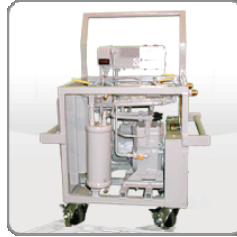
LP GAS RECOVERY